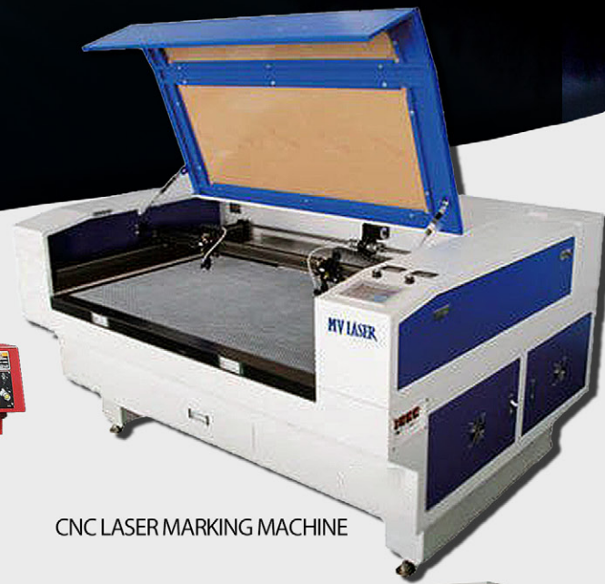
CNC LASER MARKING MACHINE