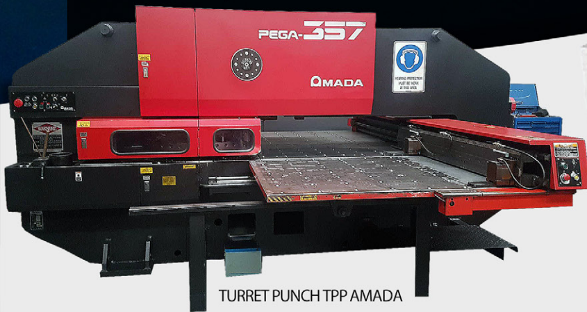
TURRET PUNCH TPP AMADA

CNC laser marking machine uses CO2 Advance RECI sealed glass laser tube with the laser power of 90Watt. The machine's working size of 600*400mm occupies the process area of 24''*18''. CNC laser marking machine bears internal motion system by using stepper motor co-operated with belt system. Some of the essential components of the machine are of top international brands like, Laser lens are imported American II V, Laser mirror is from Singapore and high quality Slider is from Taiwan. Another striking feature of CNC laser marking machine is that it has an inbuilt Wi-Fi, 750 Watt exhaust fan and 500 Watt Air pump.