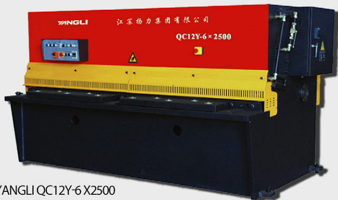
YANGLI QC12Y-6 X2500