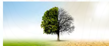
Climate Change & Disaster Mgmt.