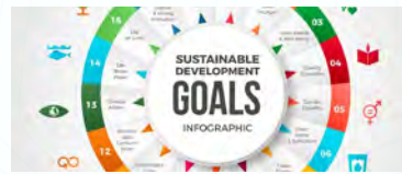
Sustainable Development Goals