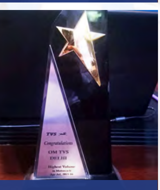
Highest Volume in motorcycle