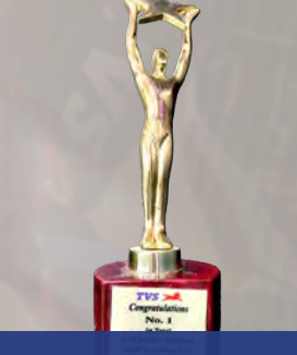
No.1 in Total 2-wheeler Volume