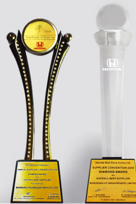
OVERALL BEST SUPPLIER DIAMOND AWARD