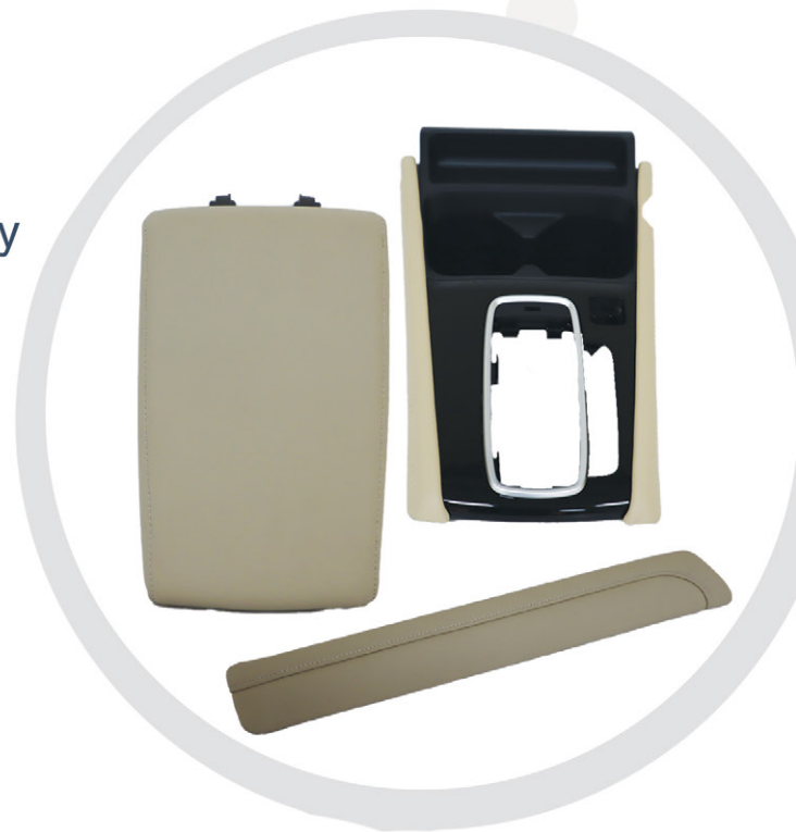
HAND WRAPPING PARTS

We make full use of advanced automated tools and machines, which are cultivated through our 350 year history in vehicle parts manufacturing. In association with our parent company in Japan, Moriroku Group, we handle the complete process of automobile part manufacturing, from design and development, to delivery. Our advanced capability in R&D entails us to simultaneously work towards enhancing the product quality. This is reinforced by the various certifications possessed by us. We have realized competitive cost performance through highly-efficient development efforts, in our areas of specialization.