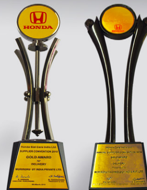
DELIVERY GOLD AWARD