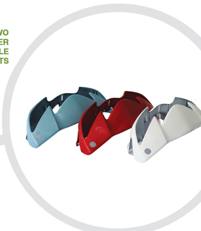
TWO WHEELER VEHICLE PARTS