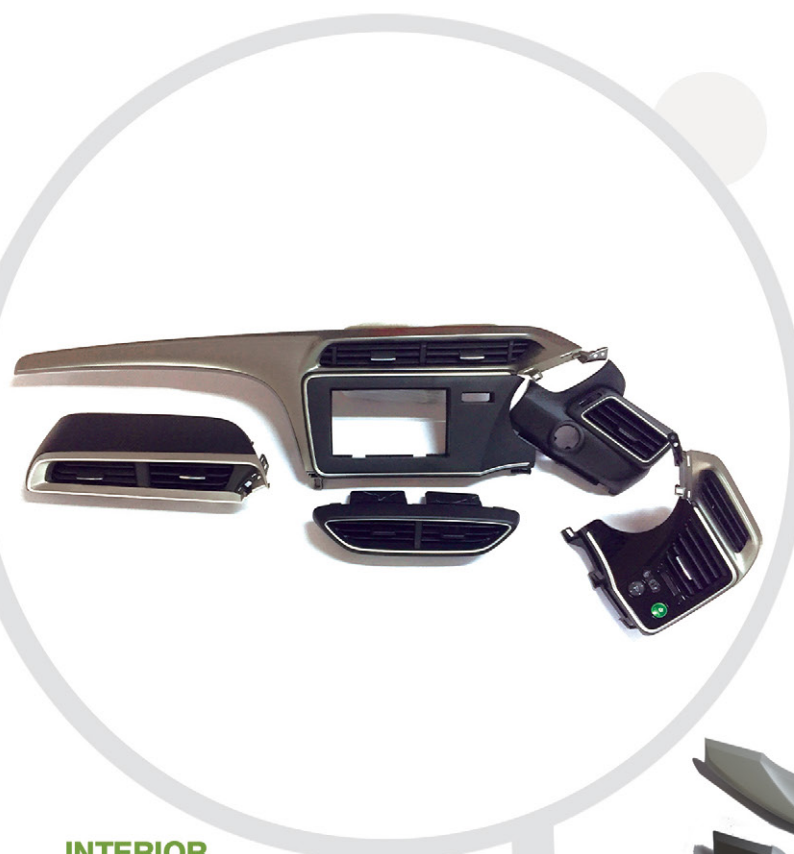
INTERIOR PARTS FOR FOUR WHEELER VEHICLES