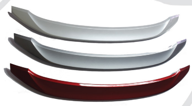
EXTERIOR PARTS FOR FOUR WHEELER VEHICLES