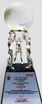
QUALITY CIRCLE AWARD