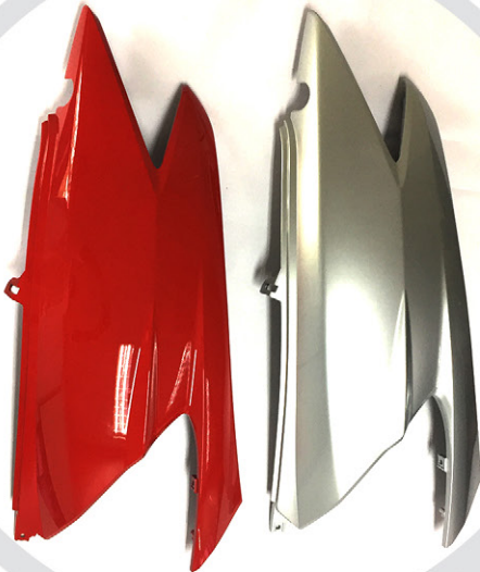
COVER HANDLE FR