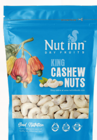
CASHEW KING 250g & 500g