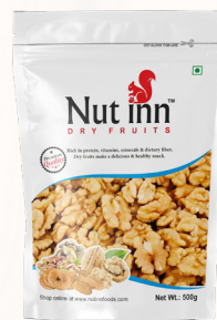
WALNUT KERNEL 250g & 500g