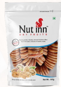
ANJEER JUMBO 250g & 500g