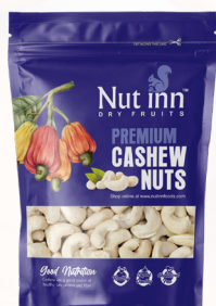
CASHEW PREMIUM 250g & 500g