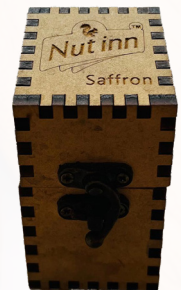
KESAR (SAFFRON) 2g