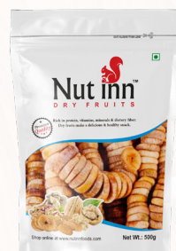
ANJEER REGULAR 250g & 500g