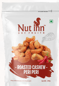
ROASTED CASHEW PERI PERI 250g