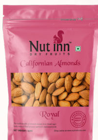
ALMONDS CALIFORNIAN ROYAL 250g & 500g