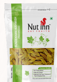
SUNDEKHANI KISHMIS 250g