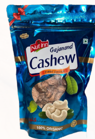
CASHEW GOA SPECIAL (NW) 250gm & 500gm