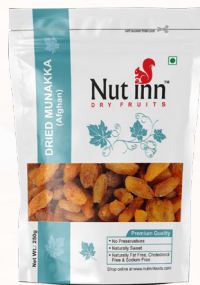
DRIED MUNAKKA 250g