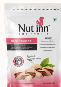
PISTACHIO IRANIAN ROYAL 250g & 500g