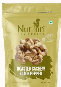
ROASTED CASHEW BLACK PEPPER 250g