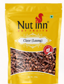
LAUNG (CLOVE) 100g