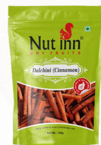
DALCHINI (CINNAMON) 100g