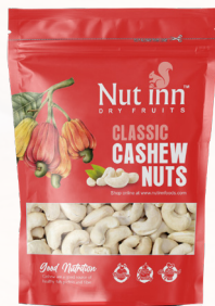
CASHEW CLASSIC 250g & 500g