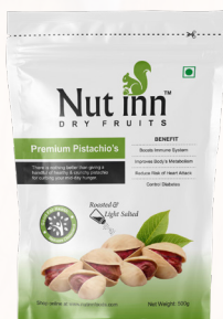
PISTACHIO IRANIAN PREMIUM 250g & 500g