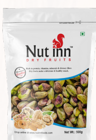
PISTA KERNEL 250g & 500g