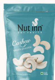
CASHEW SPLITS 250g & 500g