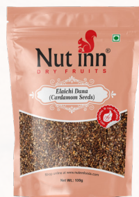
ELAICHI DANA (CARDAMOM SEEDS) 100g