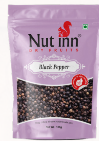
KALI MIRI (BLACK PEPPER) 100g