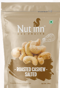
ROASTED CASHEW SALTED Available in 250g