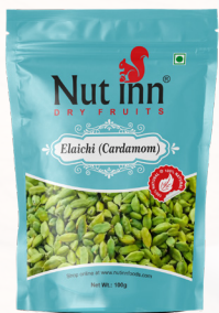
ELAICHI (CARDAMOM) 100g