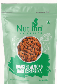
ROASTED ALMOND GARLIC PAPRIKA 250g