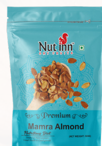
PREMIUM MAMRA 250g & 500g