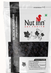
BLACK KISMIS 250g