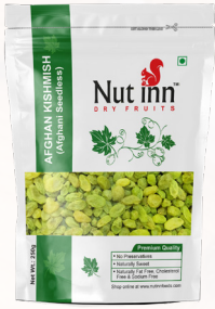
AFGANI KISMIS 250g