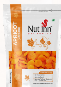
APRICOT (JARDALU) 100g