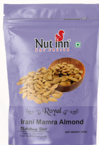
ROYAL IRANIAN MAMRA 250g & 500g