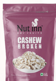
CASHEW BROKEN 250g & 500g