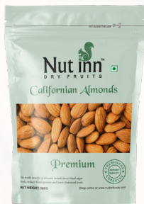
ALMONDS CALIFORNIAN PREMIUM 250g & 500g