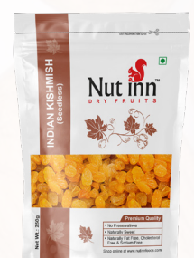
INDIAN KISMIS 250g