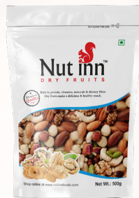
MIXED DRY FRUITS 250g & 500g