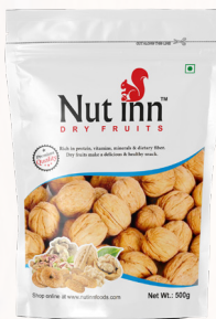
WALNUTS INSHELL CHILE 250g & 500g