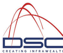
DS CONSTRUCTION, LIBYA