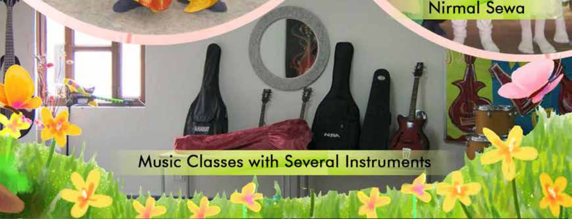
Music Classes with Several Instruments