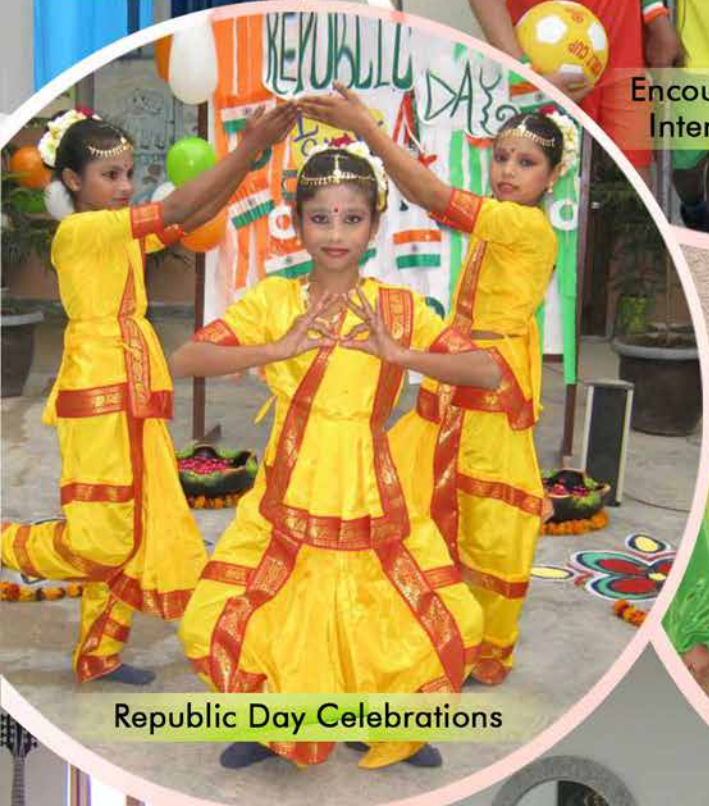
Republic Day Celebrations