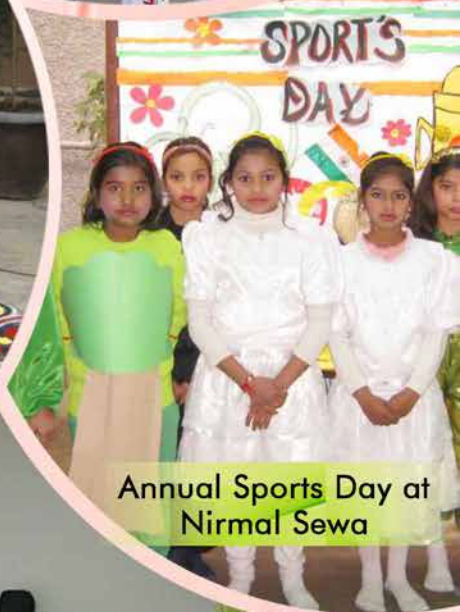
Annual Sports Day at Nirmal Sewa