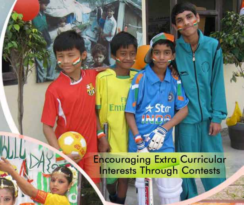
Encouraging Extra Curricular Interests Through Contests