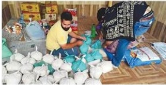
Relief material for COVID affected people being despatched by the activists of KOA and KBH at Jammu

Coming together during the time of an unprecedented rise in Covid-19 cases, KOA supplied 315 oxygen concentrators to organisations in Jammu, Delhi, and the rest of India, through Kakini. Along with concentrators, 5,000 Covid-19 protection kits were