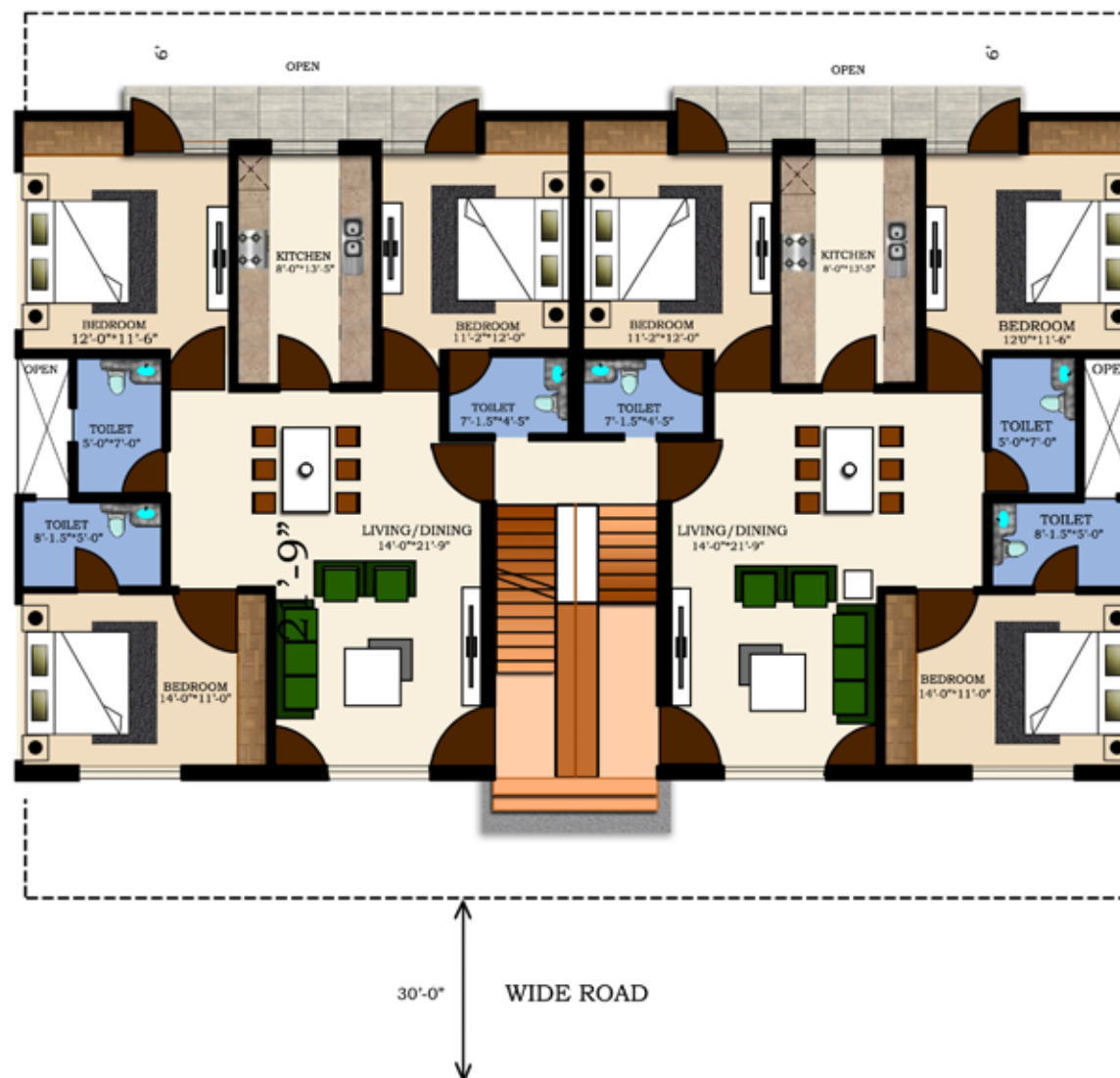
FLOOR PLAN: GROUND FLOOR